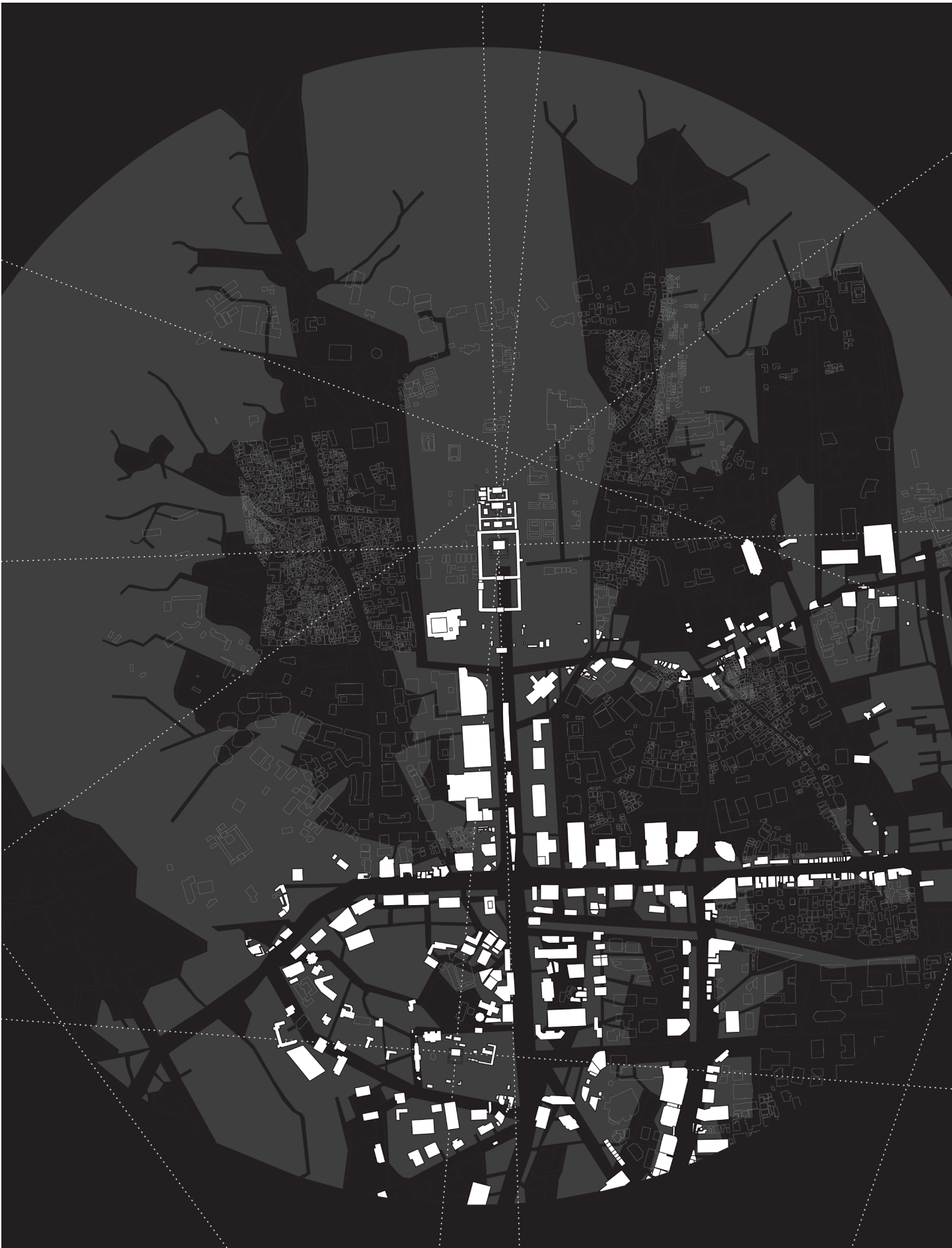
Drawing tracing the 3.1 Independence March of 1919 in colonized Keijo and contemporary Seoul