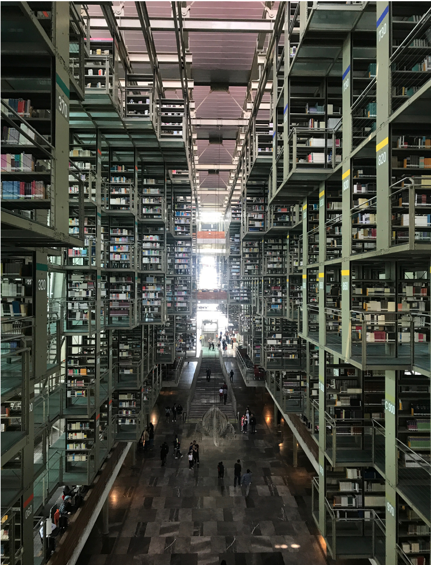
Visiting Biblioteca Vasconcelos in Mexico City